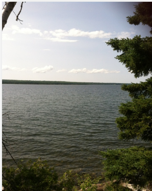
Keweenaw Bay, Lake Superior

For more information regarding the KBIC Air Quality Program visit http://nrd.kbic-nsn.gov/