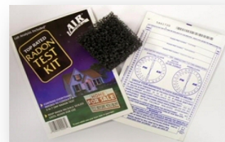
Radon Testing Kits