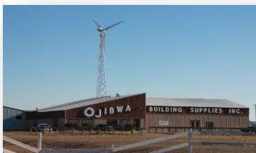
Wind turbine alternative energy

Also, the White Earth Department of Natural Resources has currently distributed five hundred radon test kits throughout the White Earth Reservation through outreach events with the community, as well as the Housing and Head Start departments.