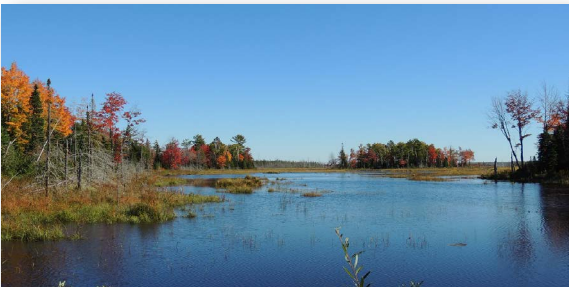
Little Bear Creek Sub-Impoundment, Lac du Flambeau Indian Reservation

For more information, please visit www.ldftribe.com/naturalresources