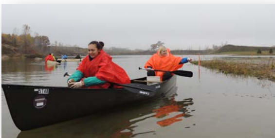
Oneida High School students planting wild rice at a restored wetland on the Oneida Reservation.

We hope to continue to bring these Departments together once we have received the final report from our lead facilitators.