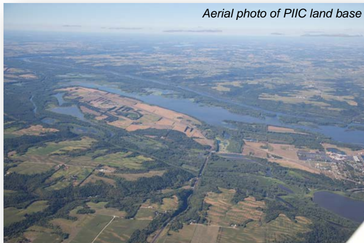
Aerial photo of PIIC land base

The Tribe received CAA 103 Air Program funding in June 2014. The new Air Program now includes an IAQ program, implementing IAQ assessments to address any issues and resulting health effects. The IAQ program focuses on education/outreach. Future plans are to have IAQ monitors and test for radon since community is located in a high risk zone. An emissions inventory is being established and will continue to be added to in the coming year. The Program is looking to increase its capacity for monitoring a wider range of air quality concerns for the future, including the use of air monitors to collect baseline ambient air data.