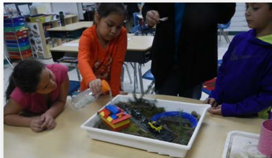
Oshki Ogimaag students learn about soil and water run-off