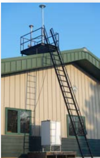
PM 2.5 Monitoring Site

The Air Program is very passionate about motivating young community members to get excited about science and natural resources and to enter into a career in natural resource management. We teach weekly lesson plans to K-6 th grades at the Oshki Ogimaag Charter School with topics ranging from wild rice seeding to moose and wolf capture and collaring.