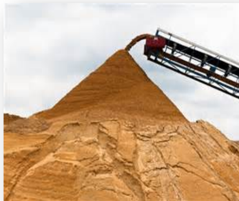
Frac Sand Mine Operation in Wisconsin

The Ho-Chunk Nation has also become aware of air quality concerns related to the frac sand industry as the Nation has numerous Tribal Members that now live within a mile or less of large Frac Sand Mines. The Ho-Chunk Nation has partnered with the Institute for Wisconsin's Health Inc. and numerous counties within Western Wisconsin to complete a Health Impact Assessment (HIA) on Industrial Sand Mining. A HIA will provide the information necessary for local and state government to make informed decisions to ensure that public health is protected. The HIA Project is scheduled to be completed in April 2016. Little research has been completed in evaluating the impacts of a single frac sand mine let alone the cumulative impacts multiple mines in a localized area. The HIA will evaluate all aspects of the mine from economics to environmental to cultural/social to determine the actual impact on community health.