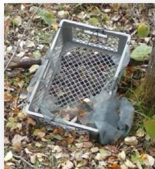
Litterfall Mercury Bin