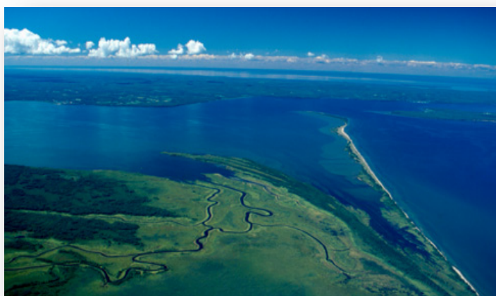
Bad River Reservation: Kakagon Sloughs, Chequamegon Bay, and Long Island

More information on Bad River's Class I and air quality program: http://x.co/BRair