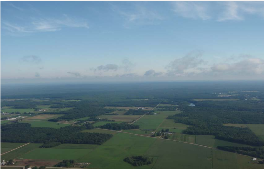
The southern part of the Reservation. Observations have been hazier than usual.

The Stockbridge-Munsee Tribe currently does not have a formal air program funded by specific air grants. The Tribal Council is currently considering investigating the process of designation of our airshed to Class 1. Intensive agricultural and continued industrial development within 50 miles of the Reservation are a concern to the Tribe. We also include indoor air quality (IAQ) assistance and investigations within the scope of activities to Tribal Members and Tribal governmental buildings. This includes investigations on mold, asbestos and radon within homes and governmental buildings and is done on an as-requested basis or where a problem is suspected. This activity is funded through a combination of EPA General Assistance Program (GAP) funding and Tribal funding. We have not received any complaints about outdoor wood boilers, however we would like to get ahead of that issue and propose changes and updates to the Tribal law, chapter 35, Air Pollution Control, before this becomes an issue.