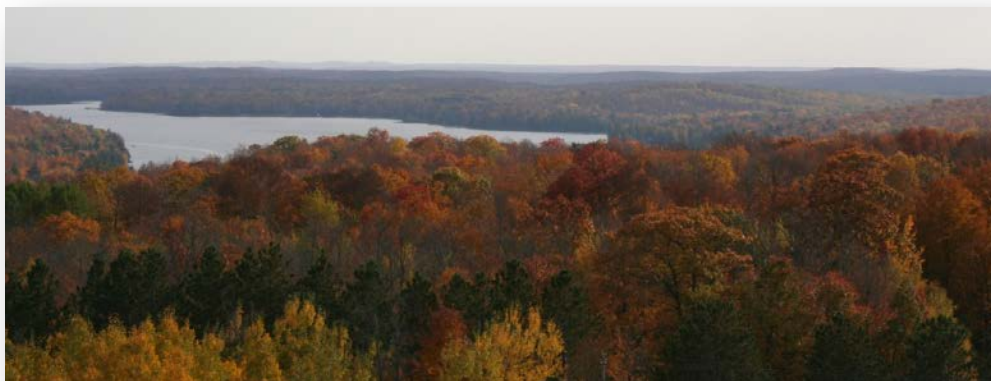
Lake Lucerne (Stone Lake), home to many of the Potawatomi who escaped the forced removal on the Trail of Death, and one of the many water resources protected by Class I redesignation.

The FCPC Ambient Air Monitoring Program, instituted in 2002 provides important information that supports the management of the Class I airshed and the selection of AQRVs and related thresholds by providing data to establish baseline air pollution trends. The extensive program monitors for O 3 , SO 2 , NO x , vaporous Hg, PM 2.5 , acid and Hg deposition. FCPC hopes to add an IMPROVE sampler to measure the visibility AQRV in the near future.