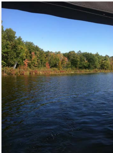
Looking for stands of wild rice and/or potential areas for restoration on Vaughn Lake, near Glennie Michigan.

The Saginaw Chippewa Indian Tribe of Michigan is looking forward to building capacity in their Air Program.