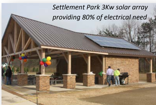
Settlement Park 3Kw solar array providing 80% of electrical need

The Gun Lake Tribe has developed a draft Climate Change Adaptation Plan utilizing PPG funding. The Tribe’s Climate Change Adaptation Plan is addressing climate change through adaptation strategies to preserve culturally significant plants and animals to the Gun Lake Tribe.